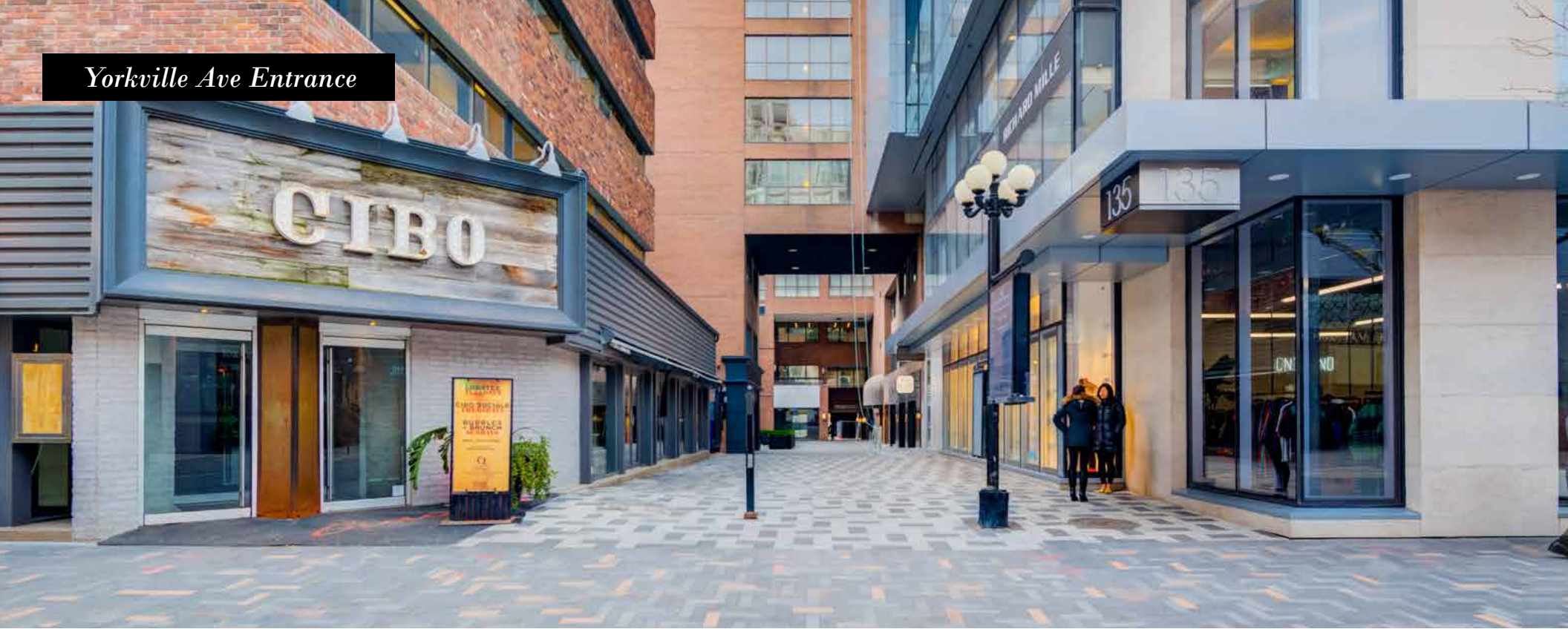
Yorkville Ave Entrance