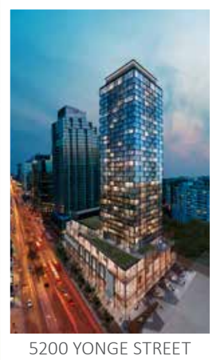
5200 YONGE STREET