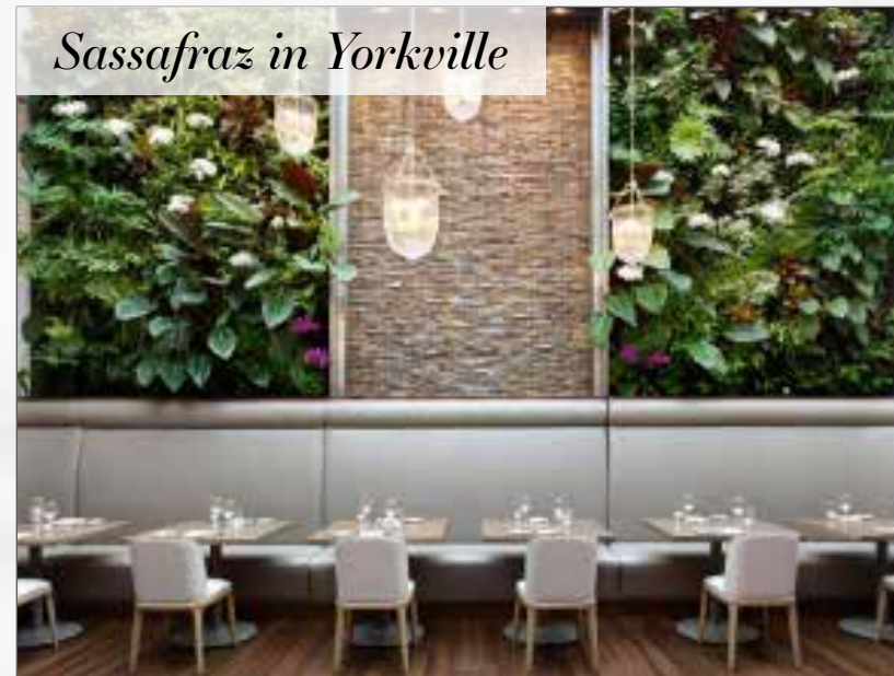
Sassafraz in Yorkville

Besides being a retail mecca, Yorkville is lined with beautiful streets and gracious history homes, mature trees and perfect little parks.