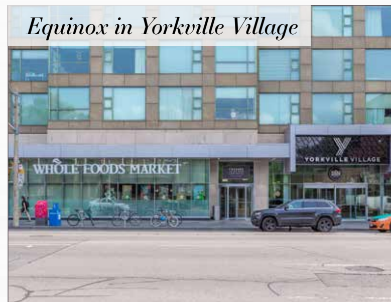
Equinox in Yorkville Village