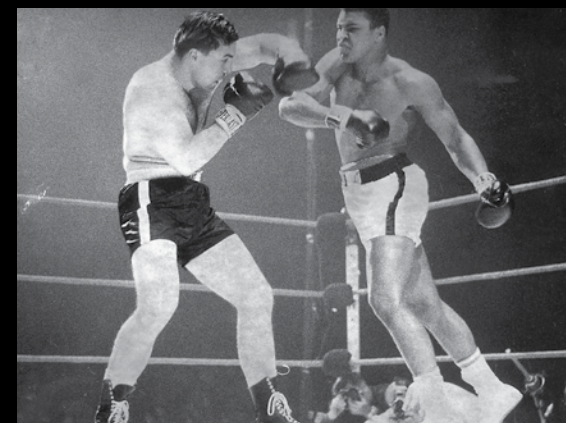
4 Muhammad Ali vs George Chuvalo 109 Ossington

In March 1966, Muhammad Ali trained at 109 Ossington to fight Toronto-born George Chuvalo for the World Boxing Council heavyweight championship at Maple Leaf Gardens.