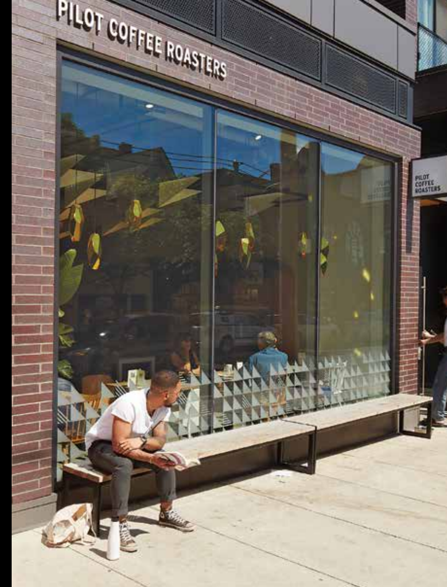
5 Pilot Coffee Roasters 117 Ossington

In March 1966, Muhammad Ali trained at 109 Ossington to fight Toronto-born George Chuvalo for the World Boxing Council heavyweight championship at Maple Leaf Gardens.