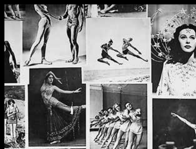
10 Misfitstudio 88 Ossington