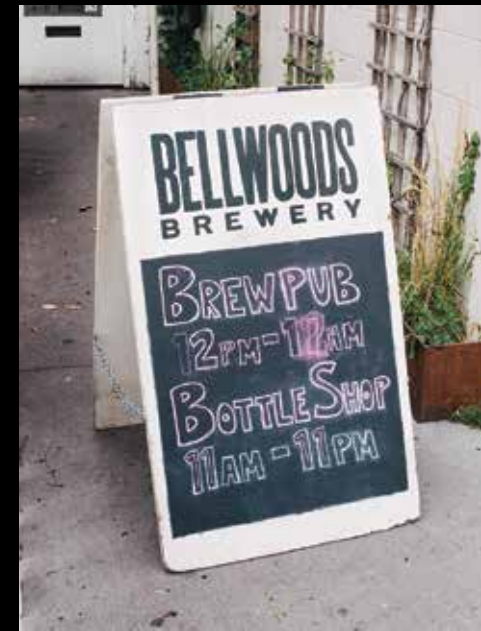
11 Bellwoods Brewery 124 Ossington