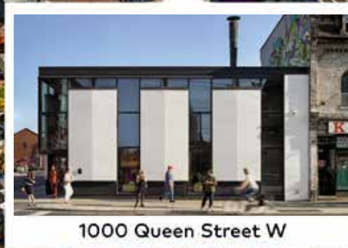
1000 Queen Street W