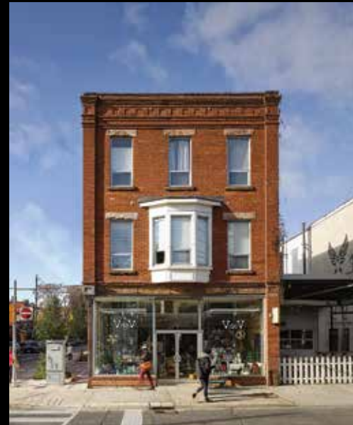
7 V de V 120 Ossington