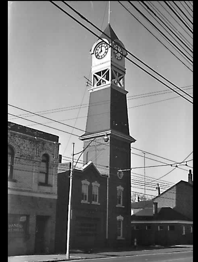
13 Fire Hall No.9, 1955