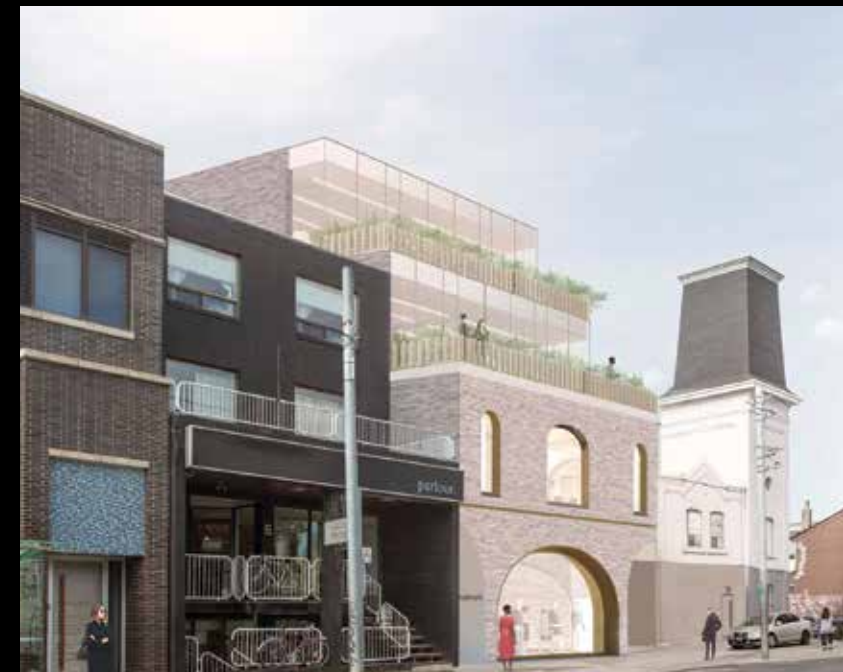
13 12 Ossington Designed by Hariri Pontarini Architects

"Ossington is an old street that carries a lot of history. History can be seen in its old brick buildings and industrial charm."