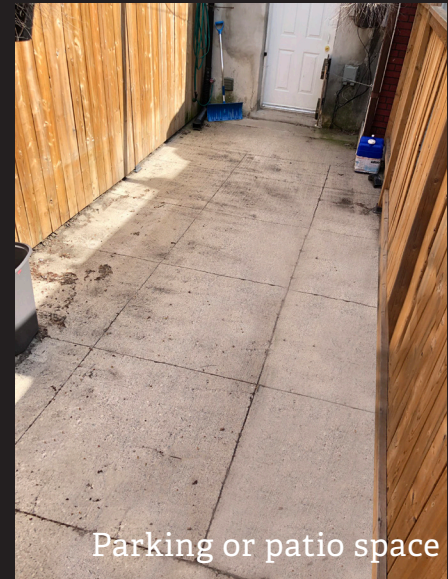
Parking or patio space