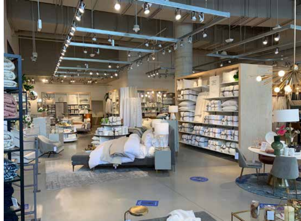
West Elm Now Open at Art Shoppe Condos