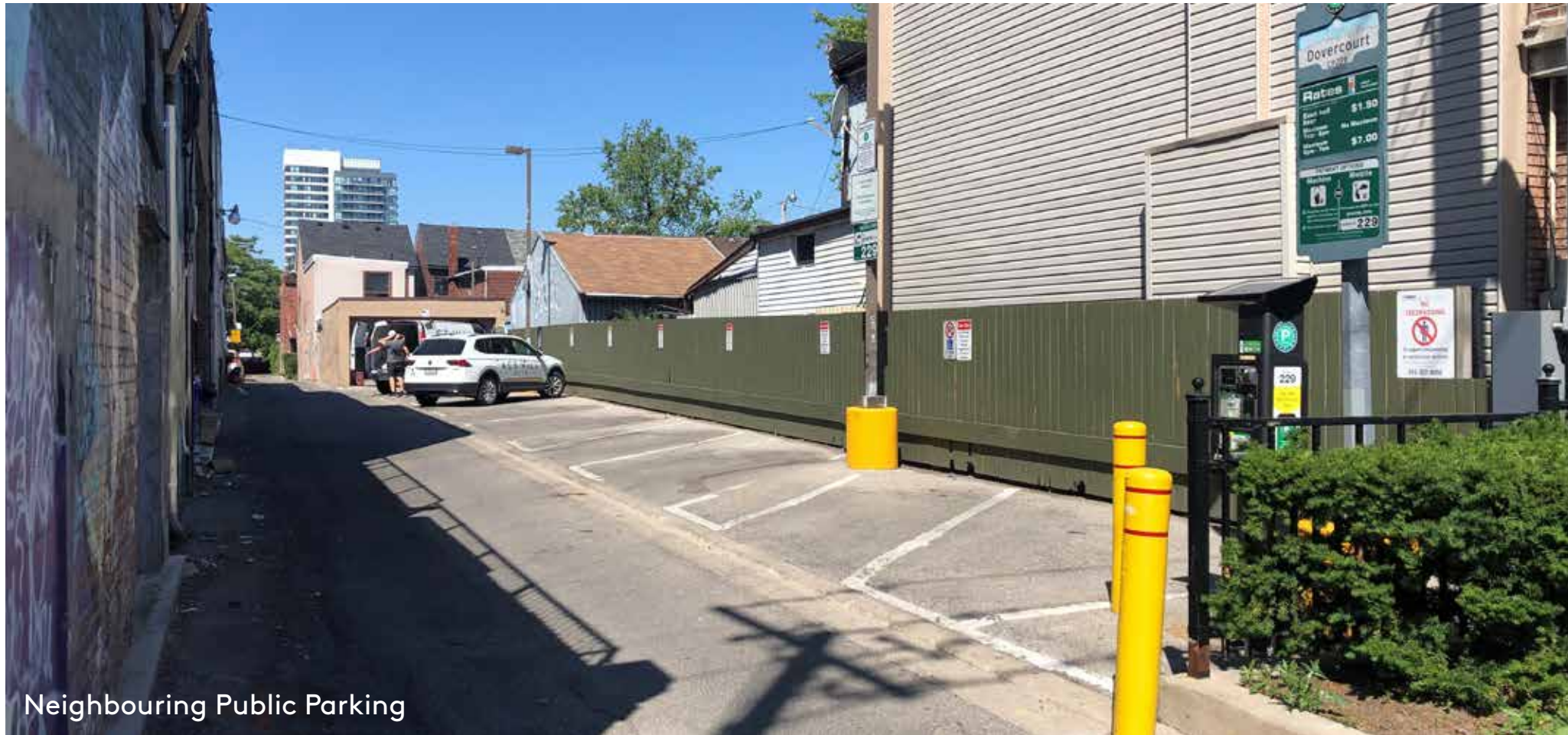
Neighbouring Public Parking