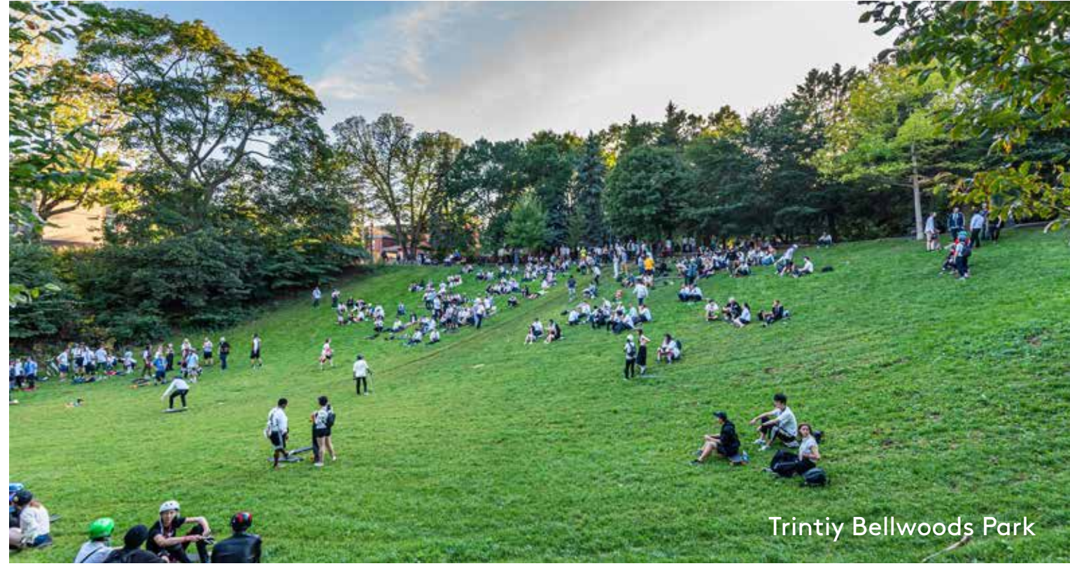
Trinty Bellwoods Park