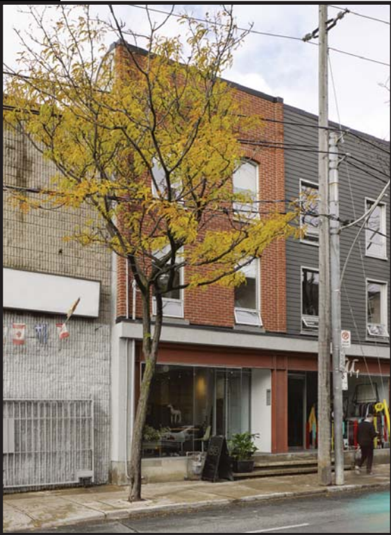
38 Ossington Avenue