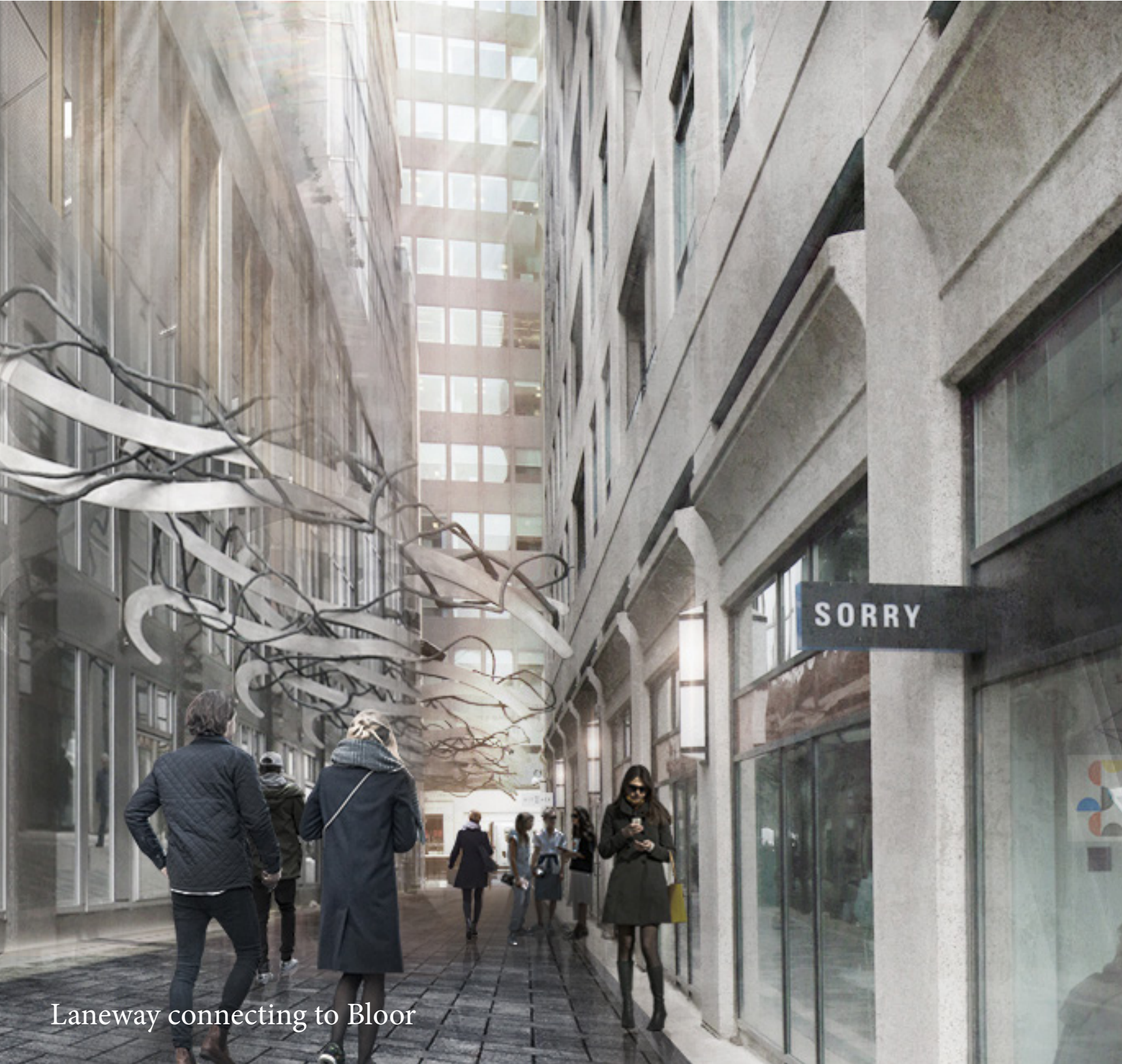
Laneway connecting to Bloor