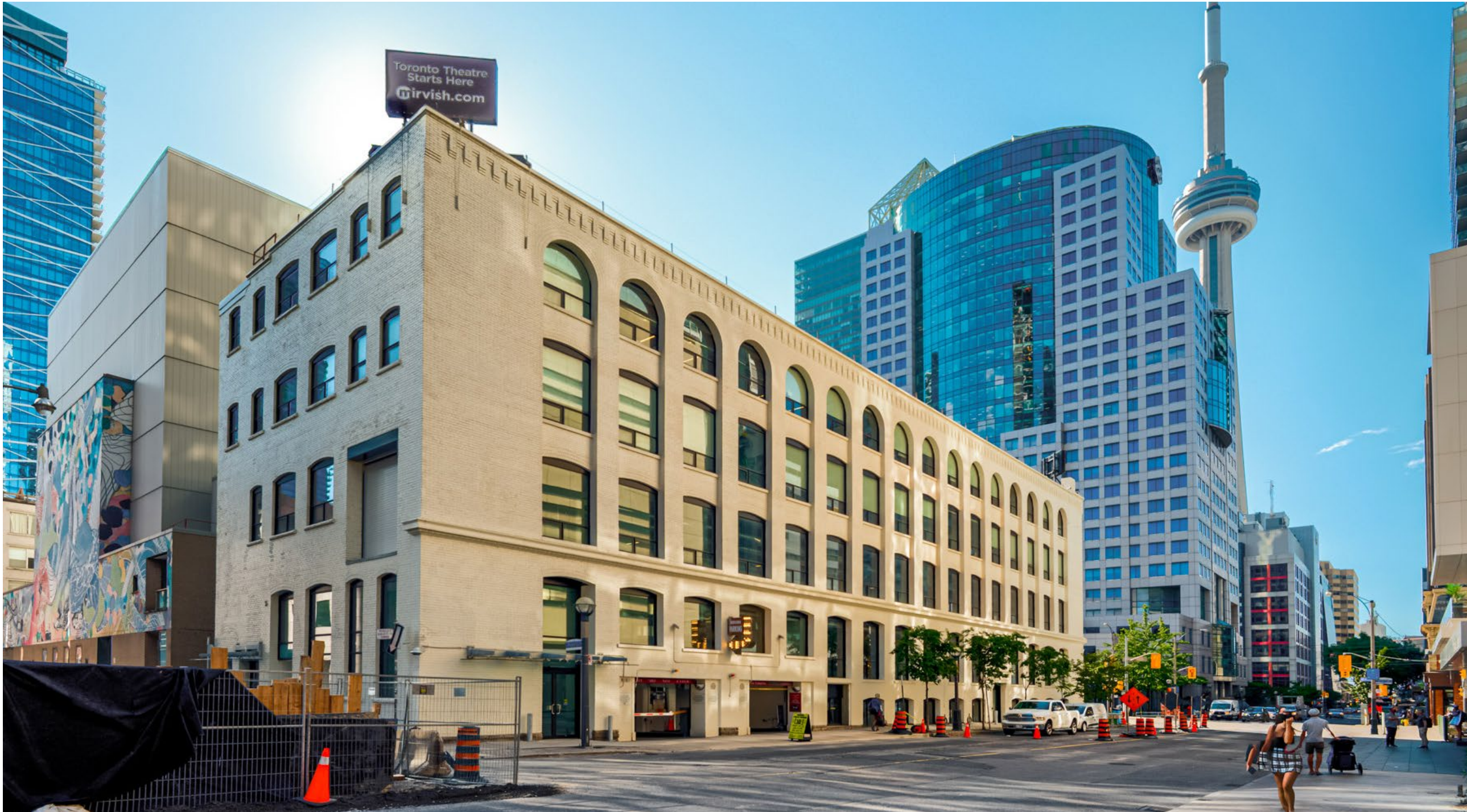
322 King Street West // Retail for Lease