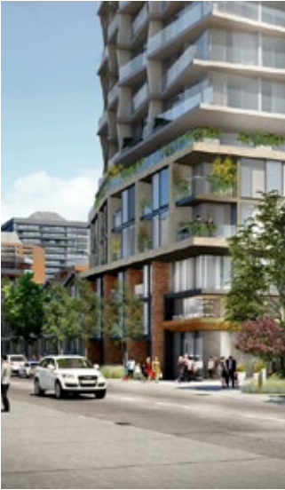
6. 29 Pleasant

29 Pleasant Blvd. Construction 302 units 34 storeys