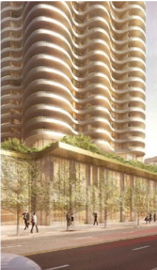
2. The Clair

1421 Yonge Street Pre-Construction 220 units 34 storeys