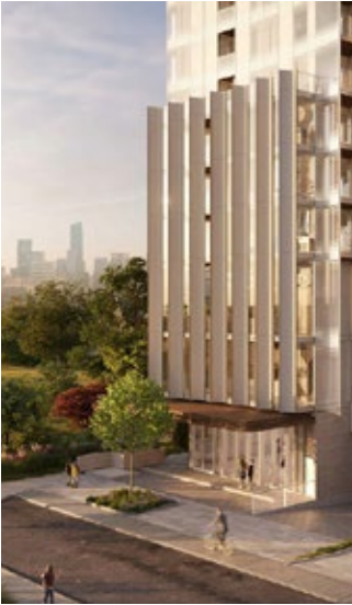
7. 49 Jackes

49 Jackes Avenue Pre-Construction 217 units 29 storeys