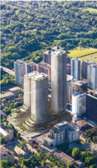
3. St. Clair Place

1535 Yonge Street Pre-Construction 1,387 units 59,39,34 storeys