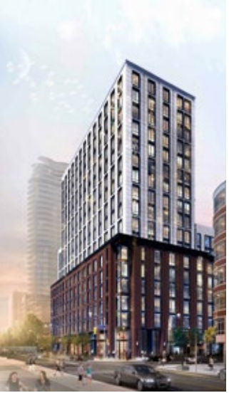
8. 1365 Yonge

1365 Yonge Street Construction 237 units 17 storeys