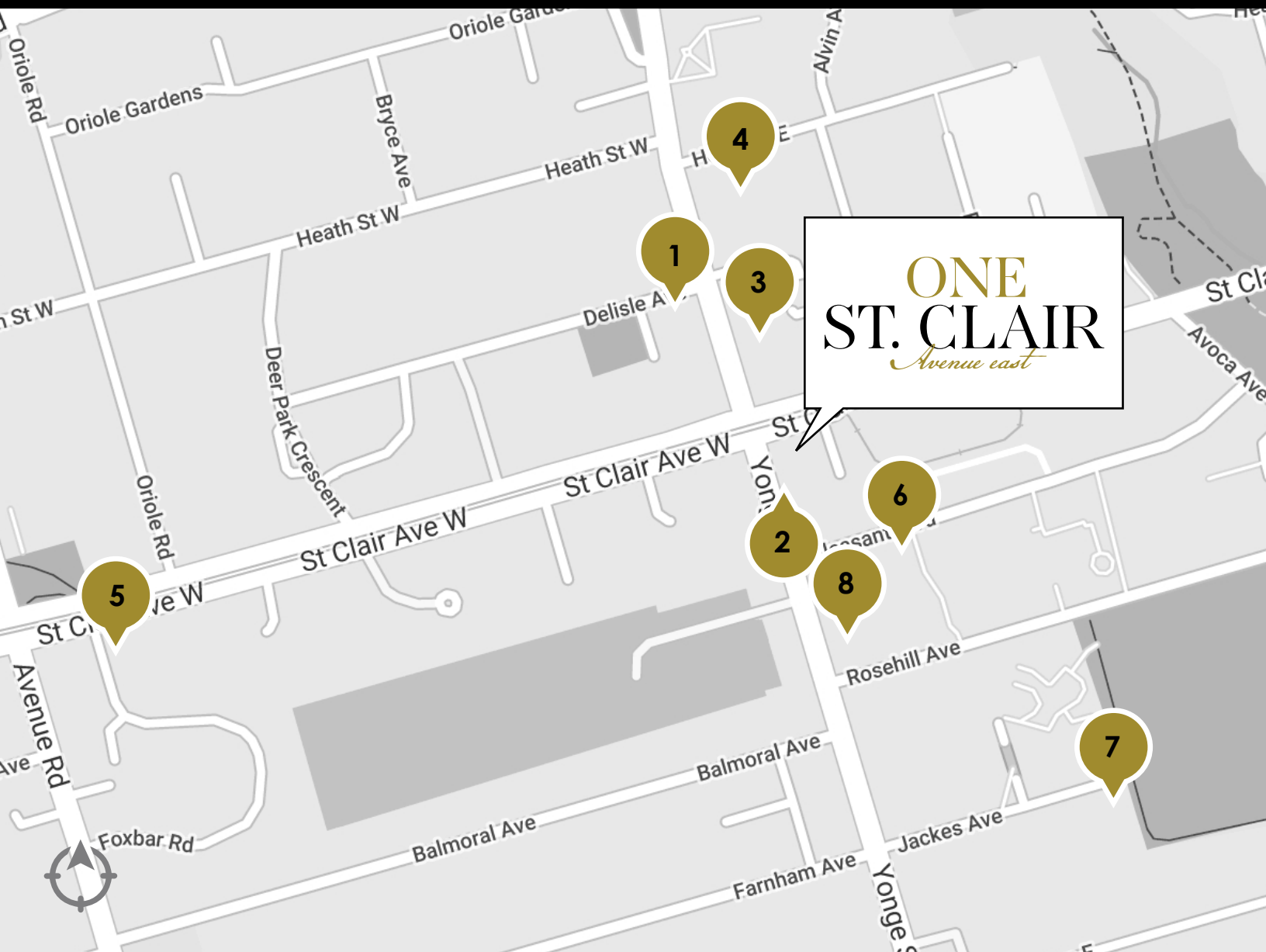
1. One Delisle