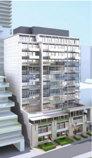
4. 7 Heath Street

7 Heath Street Pre-Construction 97 units 13 storeys