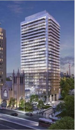
5. 129 St. Clair E

129 St. Clair Ave E Construction 259 units 28 storeys