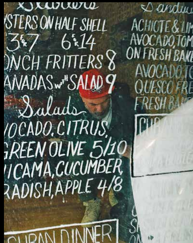
2 La Cubana 92 Ossington