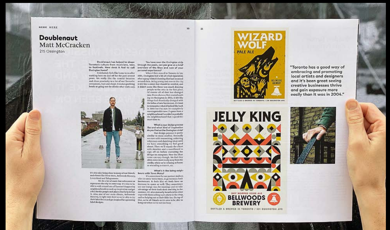
Here Here, a neighbourhood magazine published in 2019 by Hullmark in collaboration with Public Address. They interviewed and documented the people, buildings and businesses that define the Ossington community.