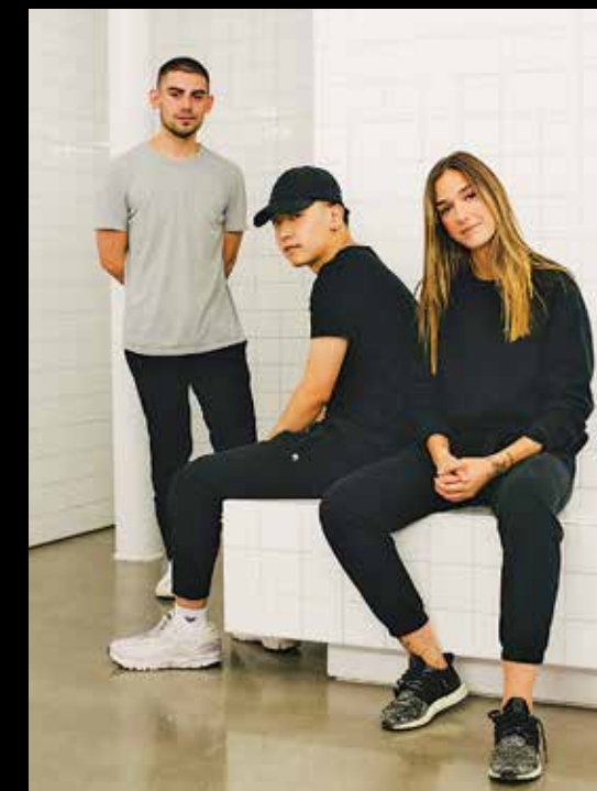
6 Reigning Champ 41 Ossington