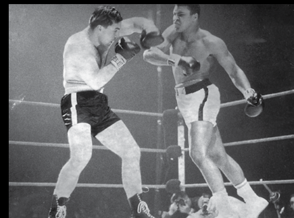
4 Muhammad Ali vs George Chuvalo 109 Ossington

In March 1966, Muhammad Ali trained at 109 Ossington to fight Toronto-born George Chuvalo for the World Boxing Council heavyweight championship at Maple Leaf Gardens.