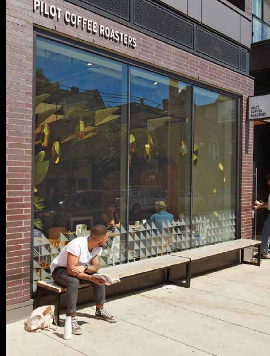
5 Pilot Coffee Roasters 117 Ossington

In March 1966, Muhammad Ali trained at 109 Ossington to fight Toronto-born George Chuvalo for the World Boxing Council heavyweight championship at Maple Leaf Gardens.