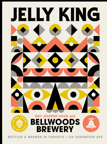
1 Doubleknaut Design 134 Ossington