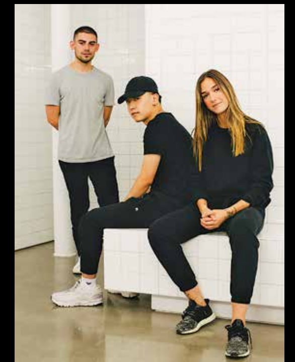
6 Reigning Champ 41 Ossington