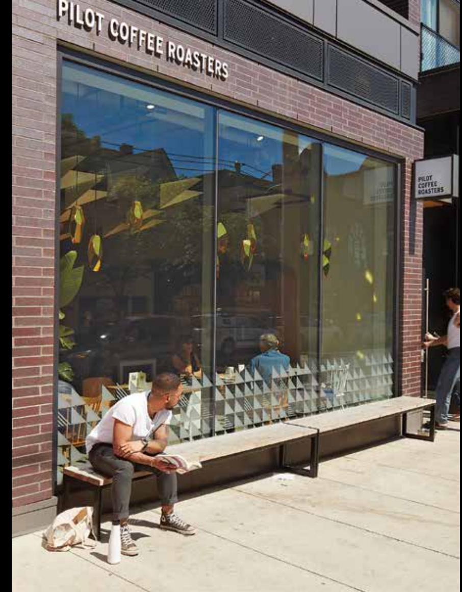
5 Pilot Coffee Roasters 117 Ossington

In March 1966, Muhammad Ali trained at 109 Ossington to fight Toronto-born George Chuvalo for the World Boxing Council heavyweight championship at Maple Leaf Gardens.