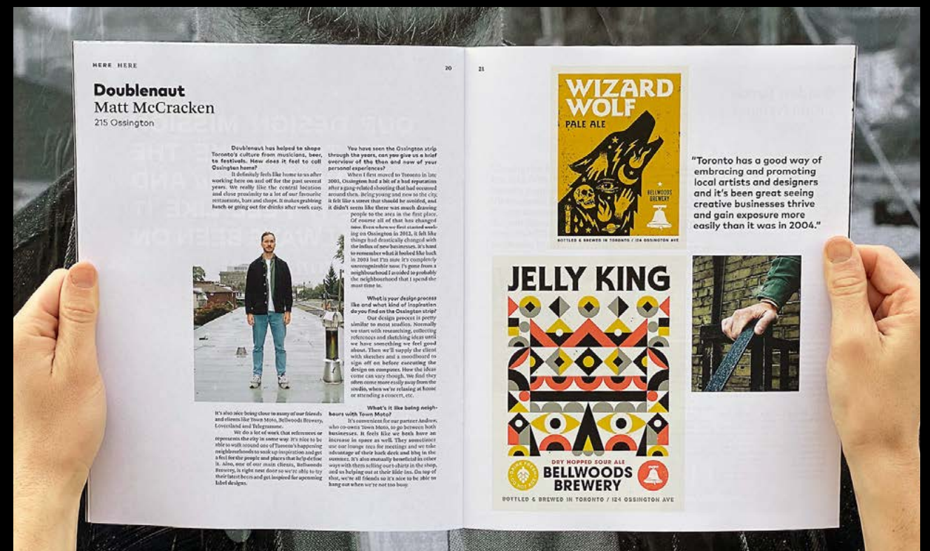
Here Here, a neighbourhood magazine published in 2019 by Hullmark in collaboration with Public Address. They interviewed and documented the people, buildings and businesses that define the Ossington community.