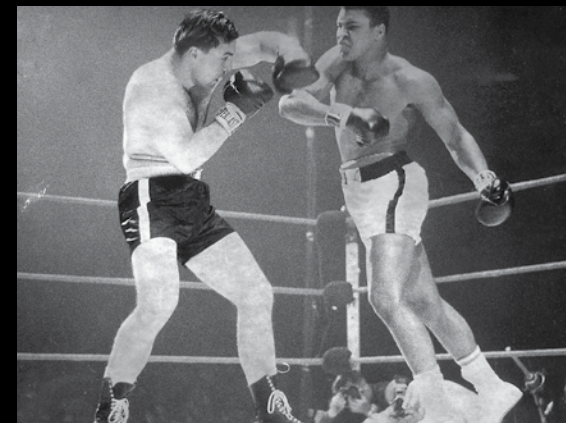
4 Muhammad Ali vs George Chuvalo 109 Ossington

In March 1966, Muhammad Ali trained at 109 Ossington to fight Toronto-born George Chuvalo for the World Boxing Council heavyweight championship at Maple Leaf Gardens.