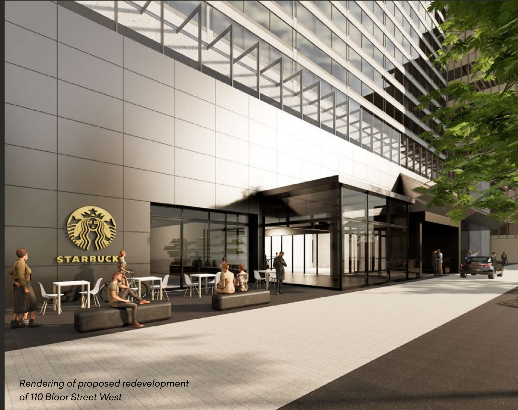
Rendering of proposed redevelopment of 110 Bloor Street West

Contact the listing team for more information.