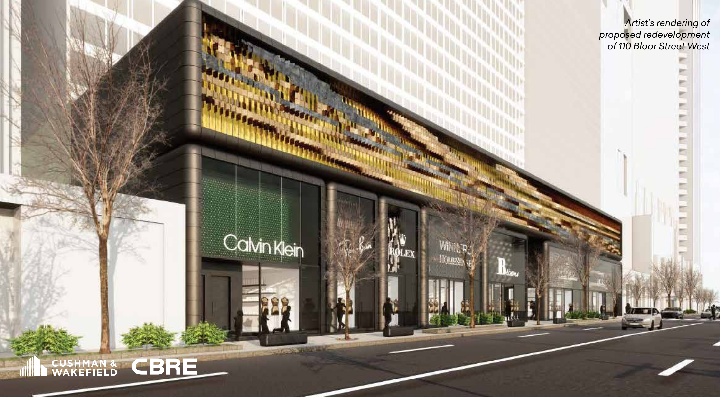
Artist's rendering of proposed redevelopment of 110 Bloor Street West