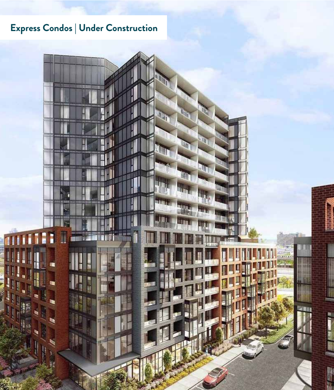
Express Condos | Under Construction