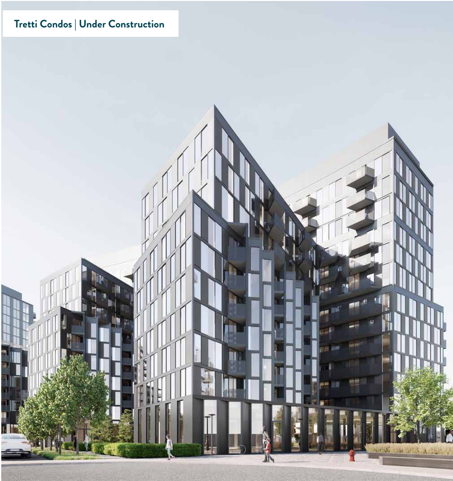
Tretti Condos | Under Construction