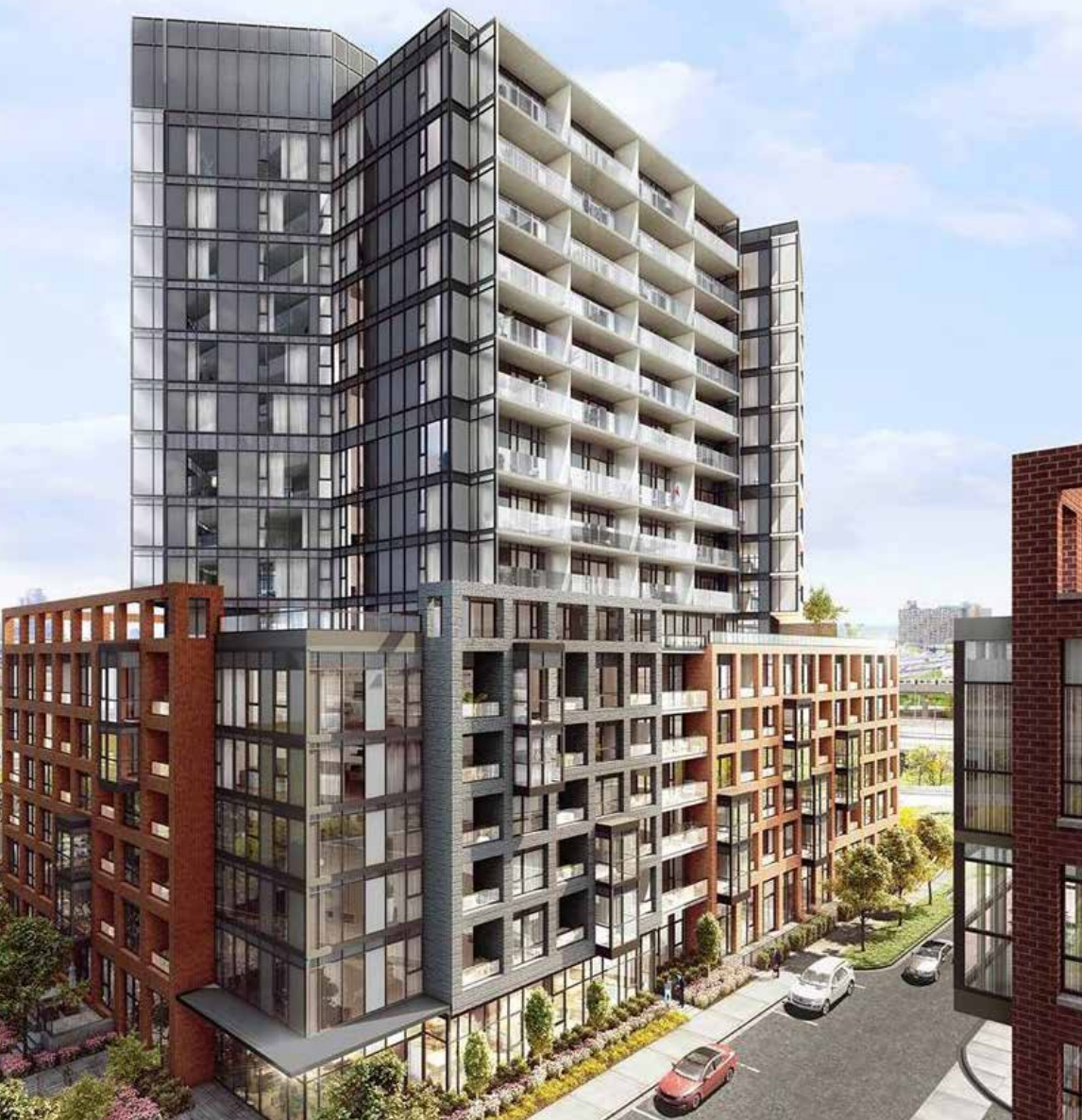
Express Condos | Under Construction