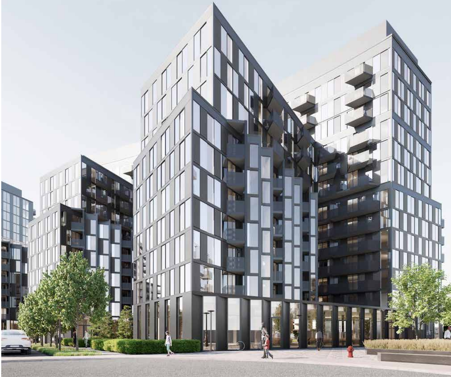
Tretti Condos | Under Construction