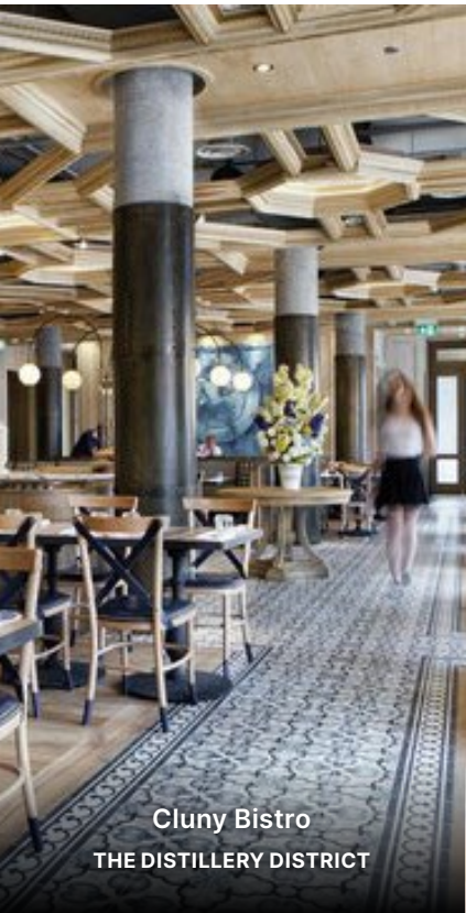
Cluny Bistro THE DISTILLERY DISTRICT

Commuters are served by the convenience of the Cherry Street streetcar. The active and outdoorsy take advantage of Corktown Common park, Distillery District, Lawren Harris Square, Underpass Park, Percy Park, the Cooper Koo YMCA, amongst others. Foodies flock to the staples in the neighborhood like Pure Spirits Oyster House and Grill, El Catrin and Cluny Bistro and Boulangerie.