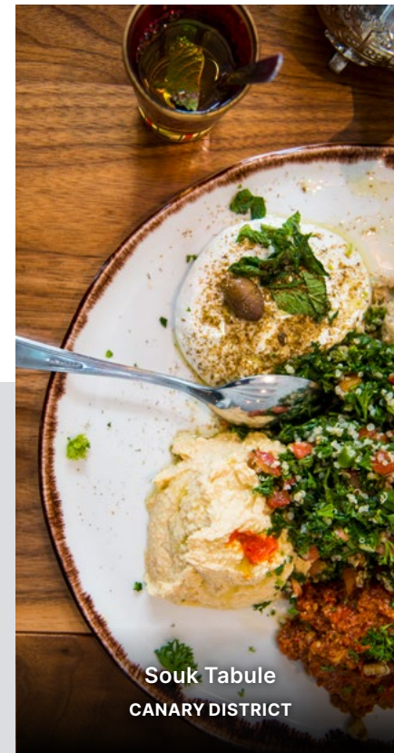
Souk Tabule CANARY DISTRICT