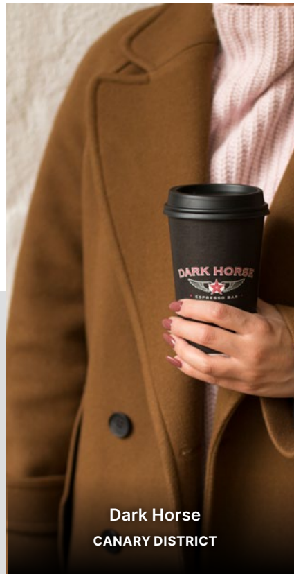
Dark Horse CANARY DISTRICT