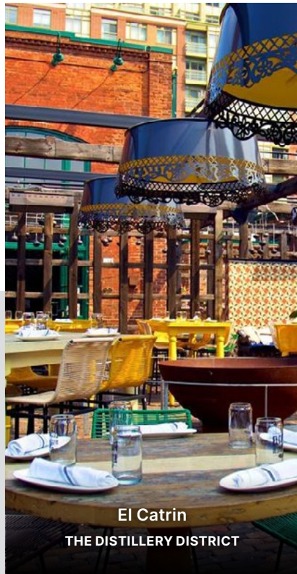
El Catrin THE DISTILLERY DISTRICT