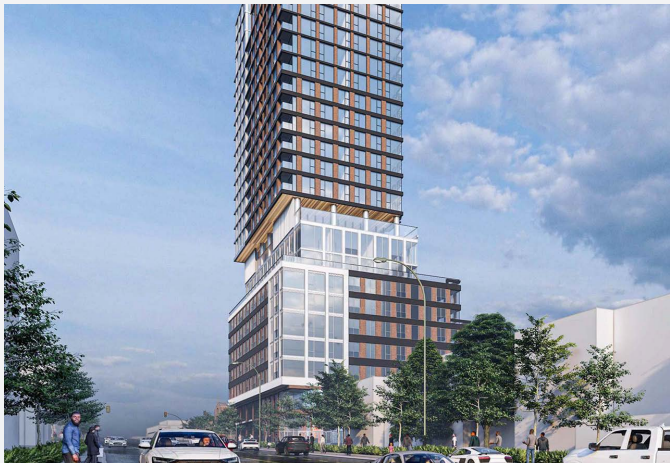
1837 Bayview Ave - Pre-Construction