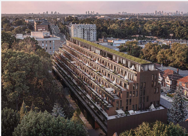
Leaside Common - Under Construction