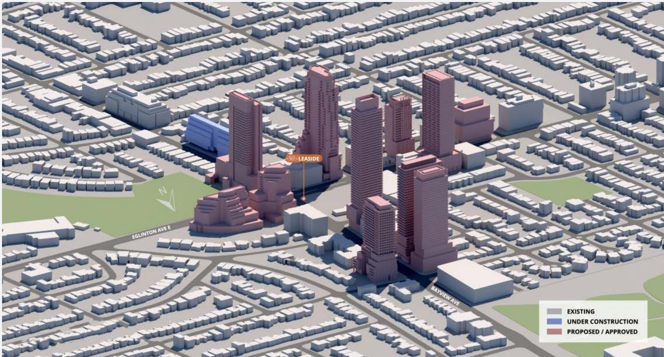
3D Model of Development Activity at Eglinton & Bayview.

Eglinton and Bayview Avenue has undergone a number of changes in the past few years with the construction of the Crosstown LRT and Leaside Station. A number of new residential high-rise towers have been proposed centered around the Eglinton and Bayview intersection and Leaside Station. Within 300 metres of the intersection, there are 10 proposed developments with a total of over 3,400 units. Leaside Common development, located just south of the intersection is currently under construction which features 197 units and has an occupancy date for next year (2025).