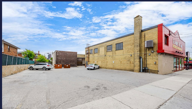
Ample Customer Parking