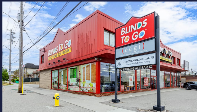
Excellent Branding/Signage Opportunities